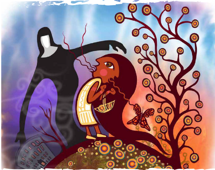
Illustrations by Donald Chrétien An Overview of the Indian Residential School System